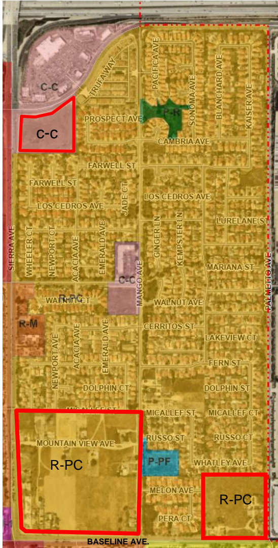
EXISTING GENERAL PLAN DESIGNATIONS