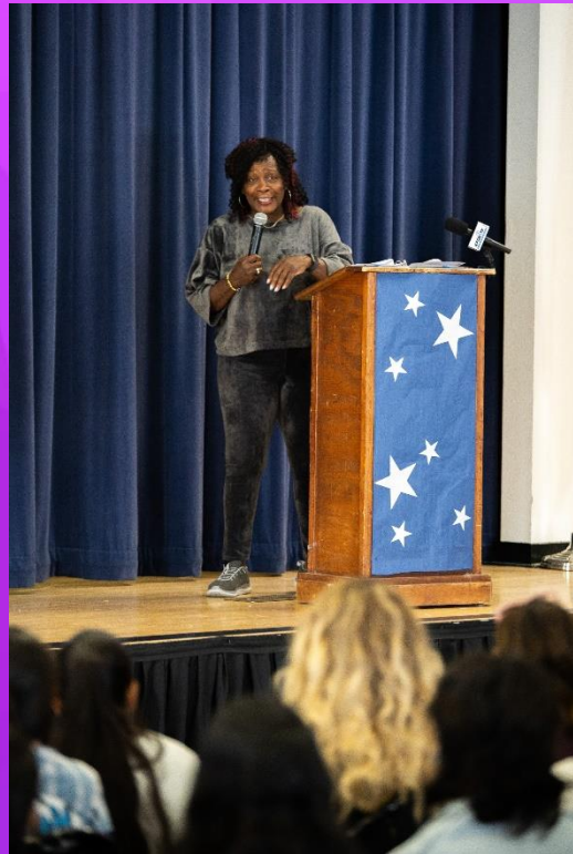
Mayor Acquanetta Warren