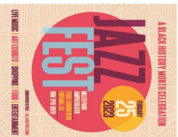
Jazz Fest February 25th 3pm-7pm