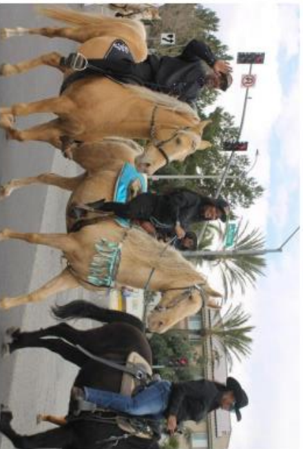
Black History Parade February 25th 10am